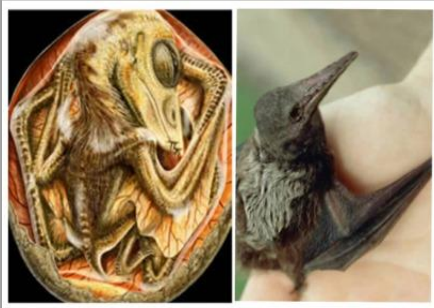
Egg found in China in 2004